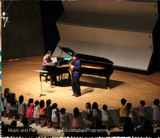
Music and Performing Arts Educational Programme