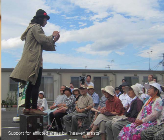
Support for afflicted areas by "heaven artists"