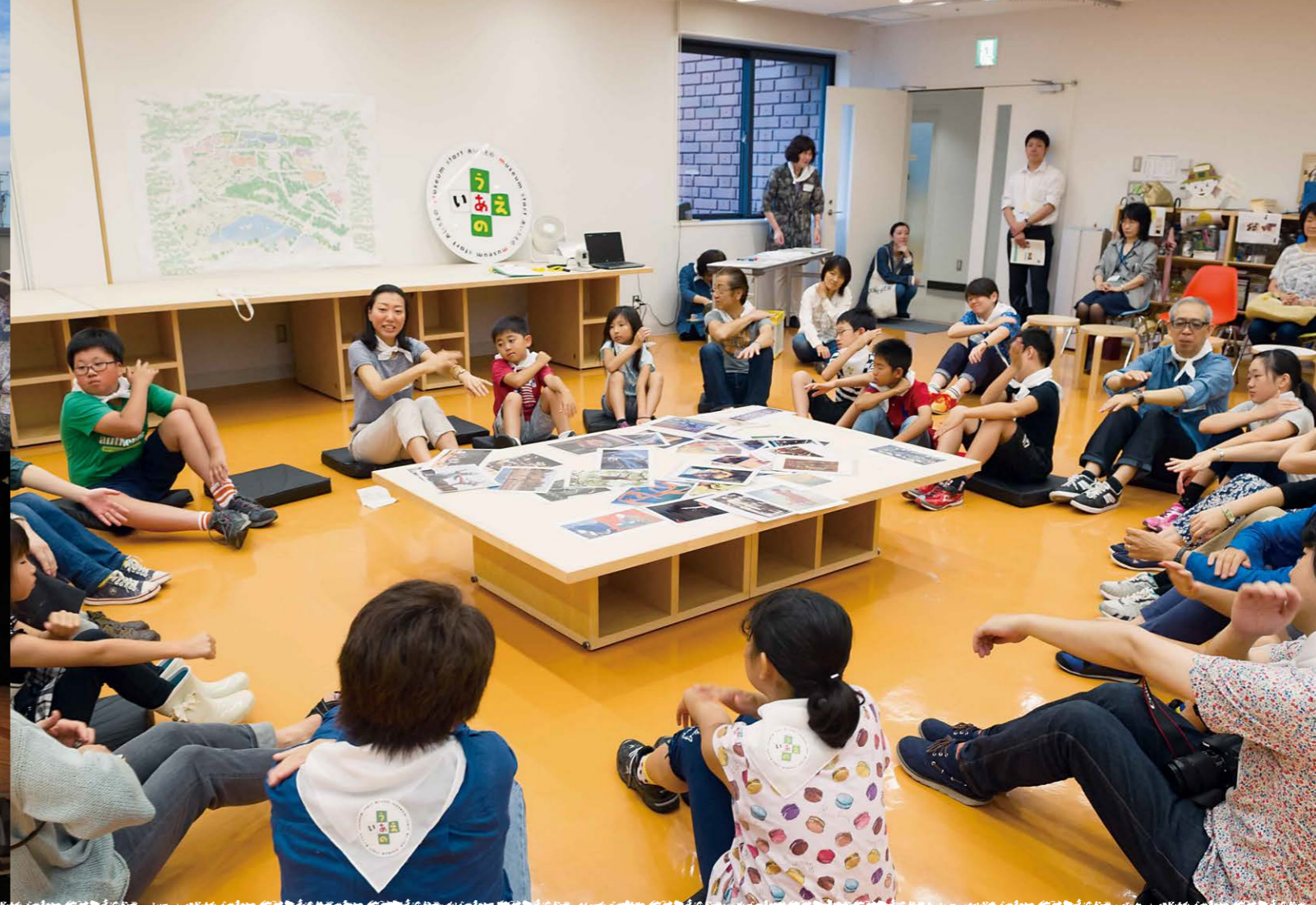
Arts and culture programmes that nurture the rich sensibilities of children (Museum Start "i-Ueno," the Tokyo Culture Creation Project Office, the Tokyo Metropolitan Art Museum, Tokyo University of the Arts)