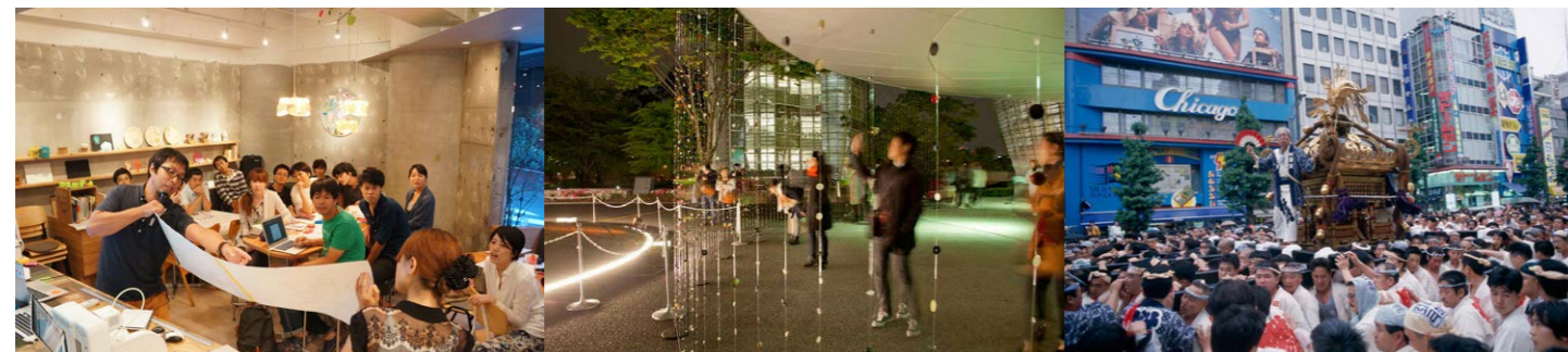
Shibuya Art Factory Project. "Fab Starters guide"

*1 Mecenat: Corporations' support for arts and culture provided as part of their social contributions instead of the immediate effects of sales promotion and advertising.